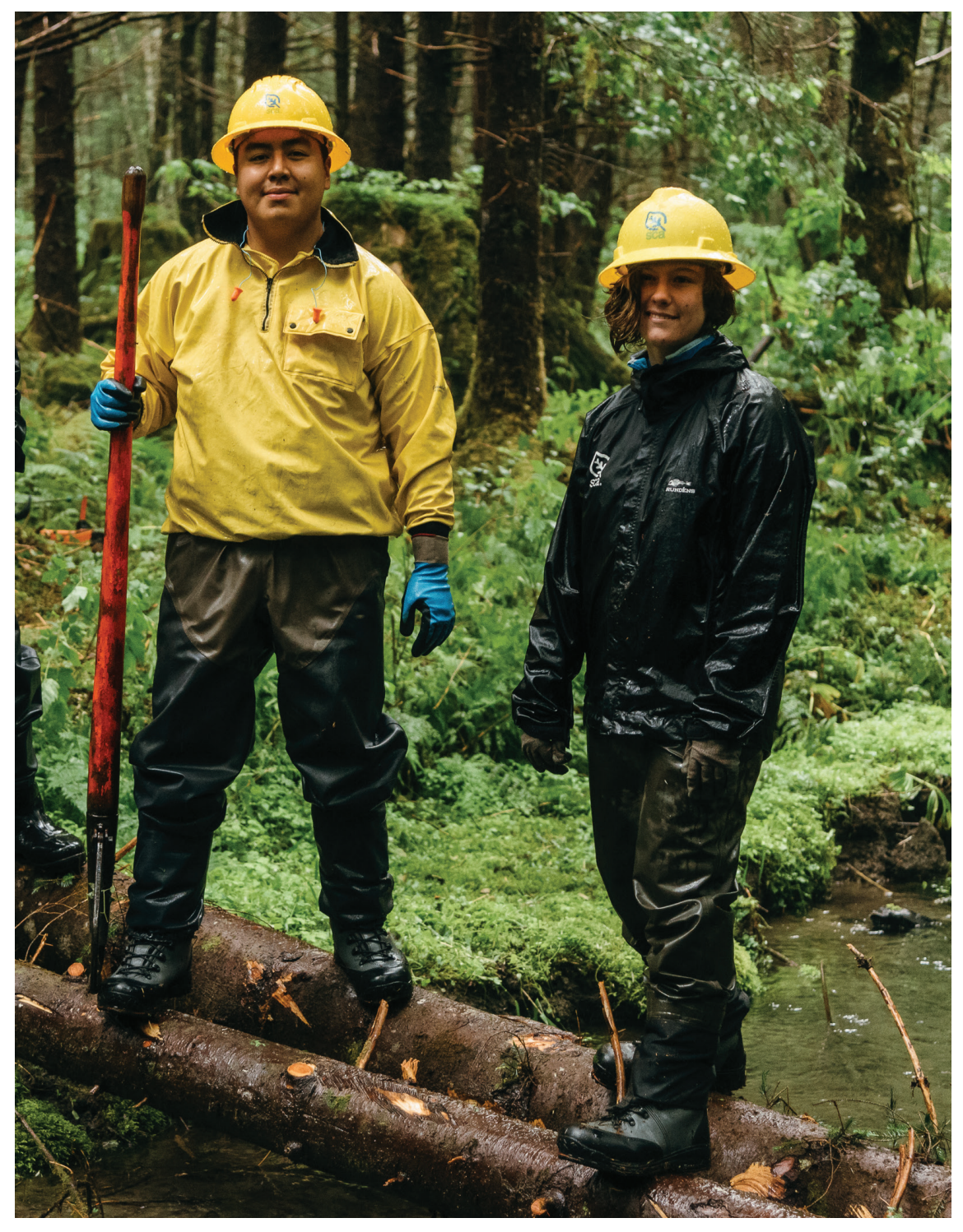
Members of TRAYLS (Training Rural Alaskan Youth Students and Leaders) pause for a picture while working on a stream restoration project near Sitka.