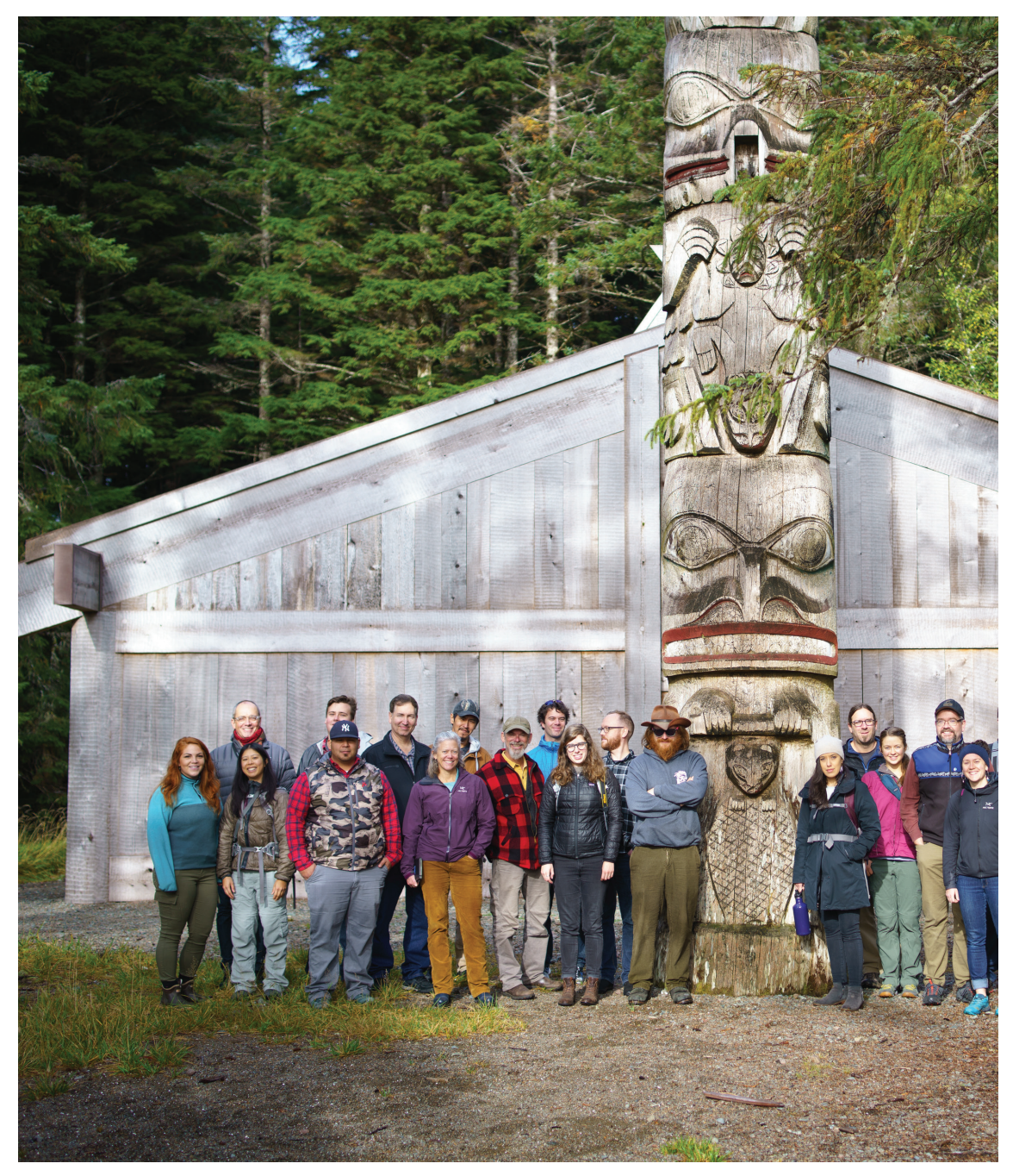
Above: Participants in the 2018 SSP Retreat on Prince of Wales Island visit the Whale House in Kasaan. Photo by Bethany Goodrich

Cover photo: Members of the Hoonah Native Forest Partnership (HNFP) after completing field surveys for wild blueberry habitat. Photo by Bethany Goodrich