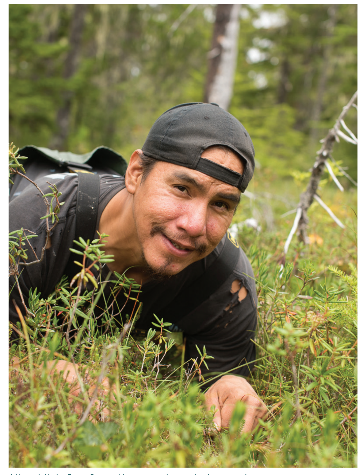
A Hoonah Native Forest Partnership crew member conducting vegetation surveys.