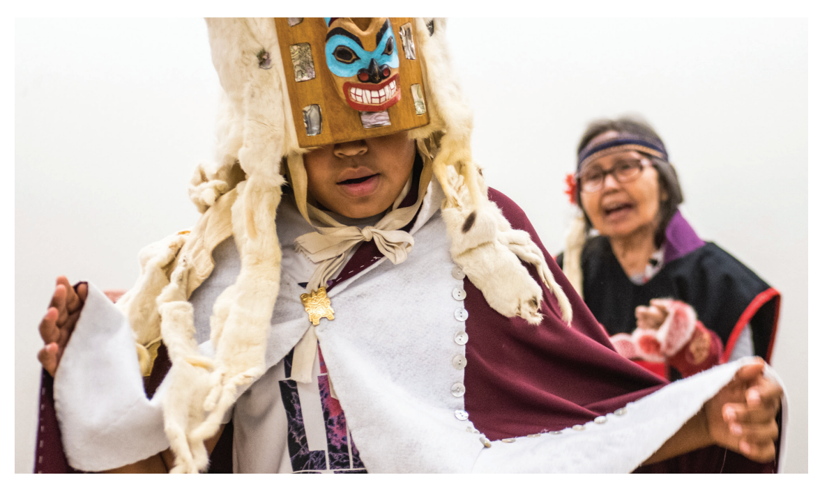
Dancers perform during an SSP retreat in Hoonah.

on community-based development. This group received a survey that asked them to rate the levels of the overarching outcomes prevailing in their community only. The second group included residents of SSP's target communities whose work included both community-based and regionally based development. This group received a survey that asked them to rate the levels of the overarching outcomes prevailing both within their respective communities and throughout the region.<sup>3</sup> Finally, one regional stakeholder took the Regional Survey only, since they did not live in an SSP target community but had a clearly defined mandate to work across the region.