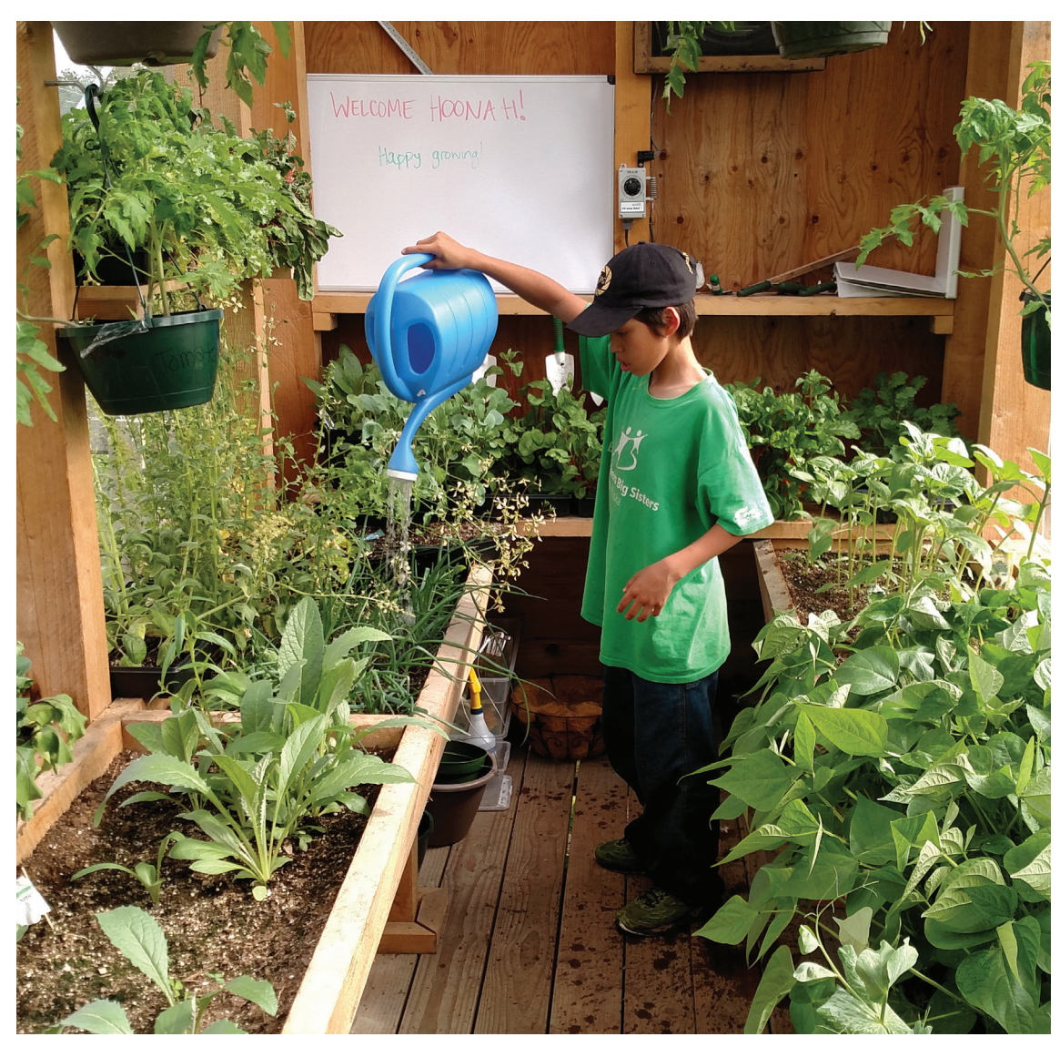
A student waters vegetables in MOBY the Mobile Greenhouse during a stop in Hoonah.