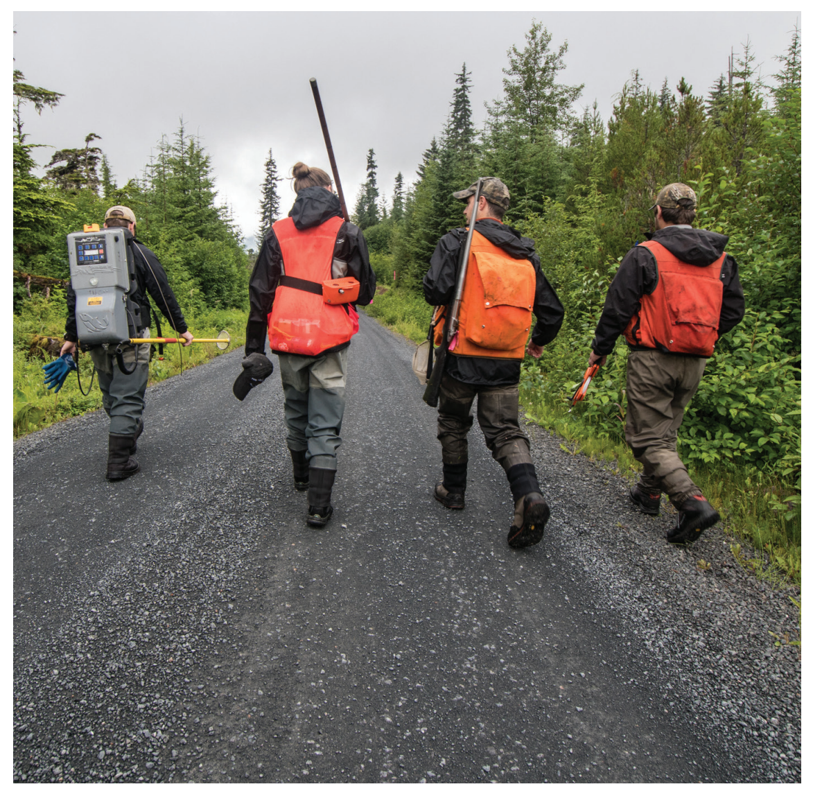
Members of the Hoonah Native Forest Partnership (HNFP) set out into the field on their way to conduct fish surveys.

As noted in the previous chapters, SSP works on two levels simultaneously: within communities, to promote a range projects and programs based on each community's self-identified priorities; and across the region, to promote cooperation and solutions across stakeholder groups, from conservation nonprofits to Alaska Native corporations including those that conduct timber harvesting. Thus, similarly to the surveys that asked different groups of stakeholders to measure community and regional changes in overarching outcomes, we ask different groups of stakeholders to weight the relative importance of those changes at the community and regional levels. We asked those whose work focuses on regional-level solutions to weight the importance of regional changes, and those whose work focuses on community-level solutions to weight the importance of community-level changes.