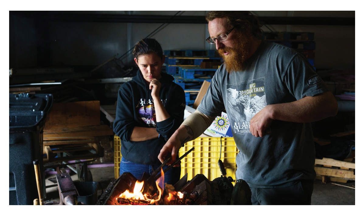
An instructor demonstrates a method of metal working during a TRAYLS training.

Age diversity was also similar to the Community Survey. Given category ranges from "18-24" to "Over 75," the largest group of respondents were in the 25-34 range (8 out of 20), followed by the 35-44 age range (5 out of 20) and then the 55-64 age range (4 out of 20).