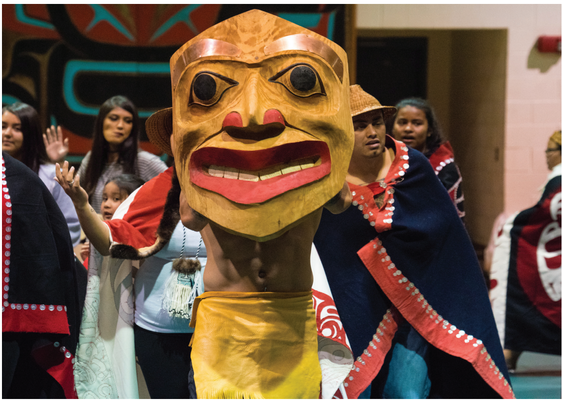
(Top) A group of students tour a biomass greenhouse in Kasaan. (Bottom) A dancer at the Hydaburg Culture Camp performs wearing a large wooden mask.