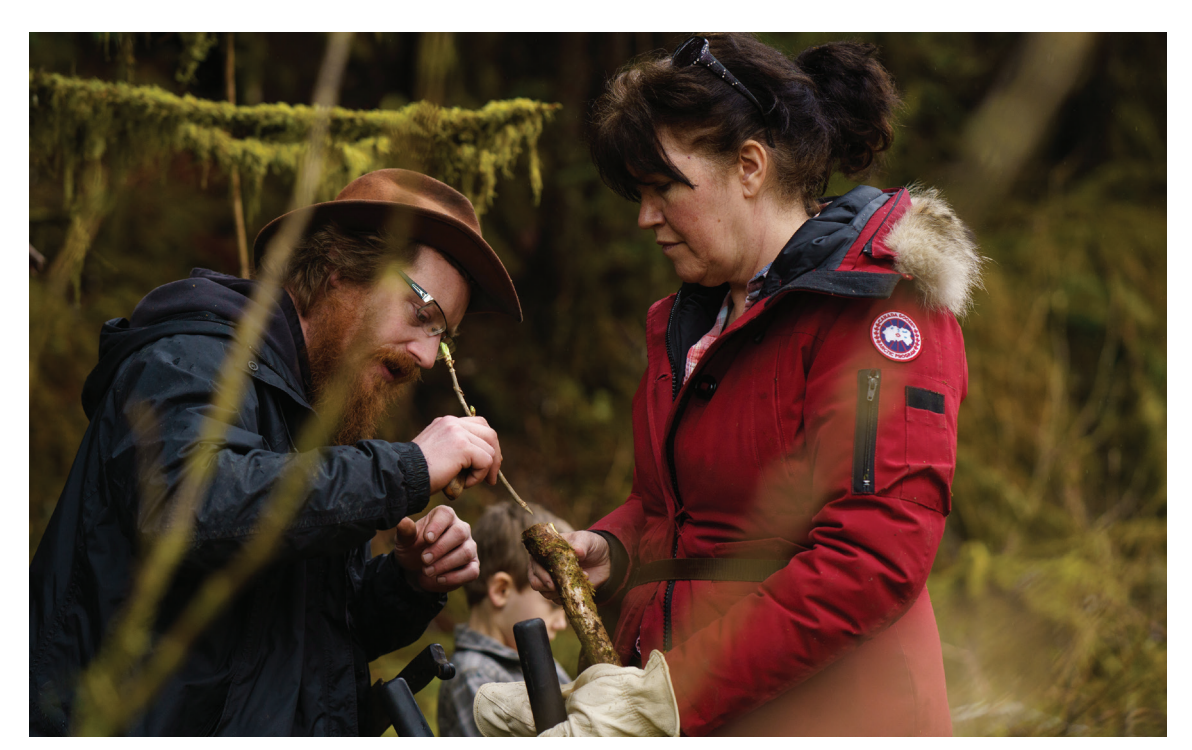
Participants in Health Hikes learn how to harvest and explore the uses of Devil's Club near the village of Kasaan.

Ten years ago, the founders of SSP endeavored to forge a new vision for resource management and community-based economic development in Southeast Alaska. This vision centered around advancing the priorities of the region's communities, while also emphasizing the importance of regional collaboration across organizations and interest groups that had previously been at odds with one another. The evidence presented in this report supports the conclusion that SSP has so far succeeded in advancing this new vision in measurable ways, at both community and regional levels. Work remains to be done to build upon the positive changes in the overarching outcomes identified by SSP's regional leaders. While the region has made great progress since 2009, the survey results in Chapter 2 reveal that these overarching outcomes are still well below their highest possible levels. The increased collaboration advanced by SSP's work can provide a firm foundation on which to continue to build, refine, and develop this new vision.