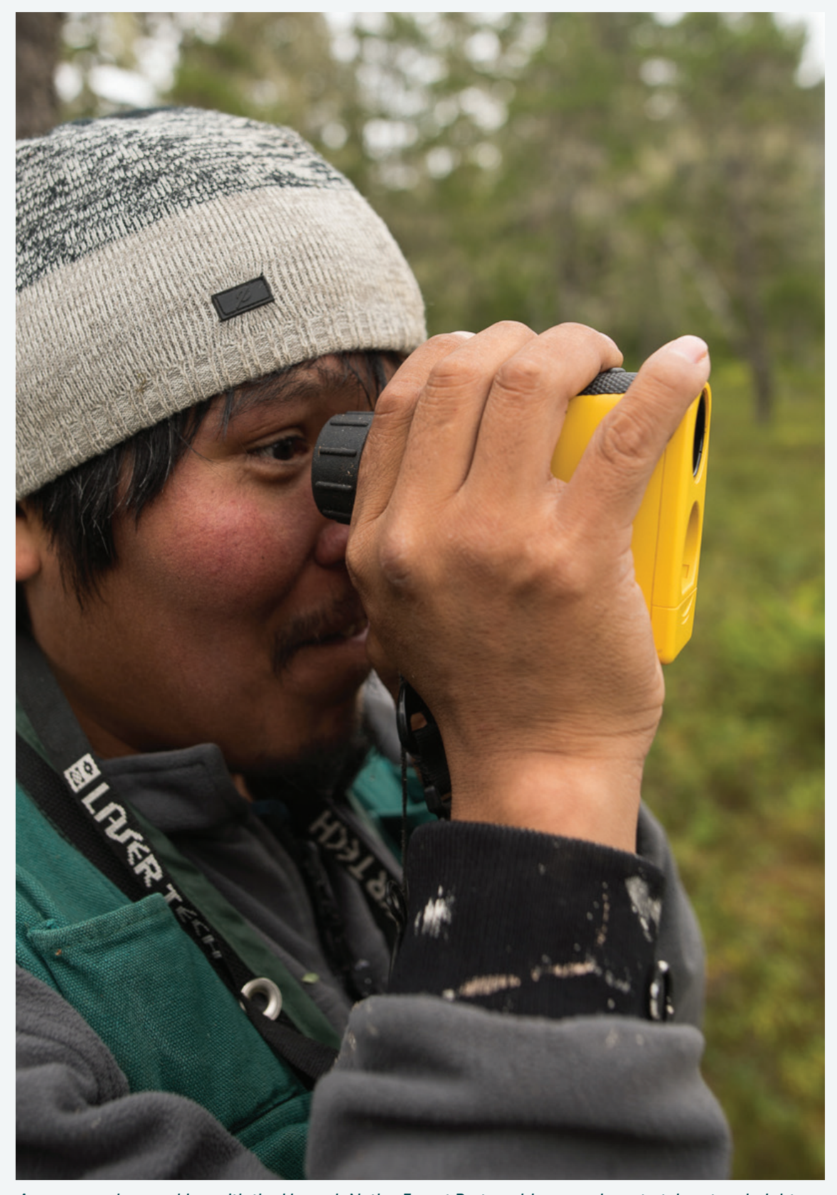
A crew member working with the Hoonah Native Forest Partnership uses a laser to take a tree height during vegetation surveys.