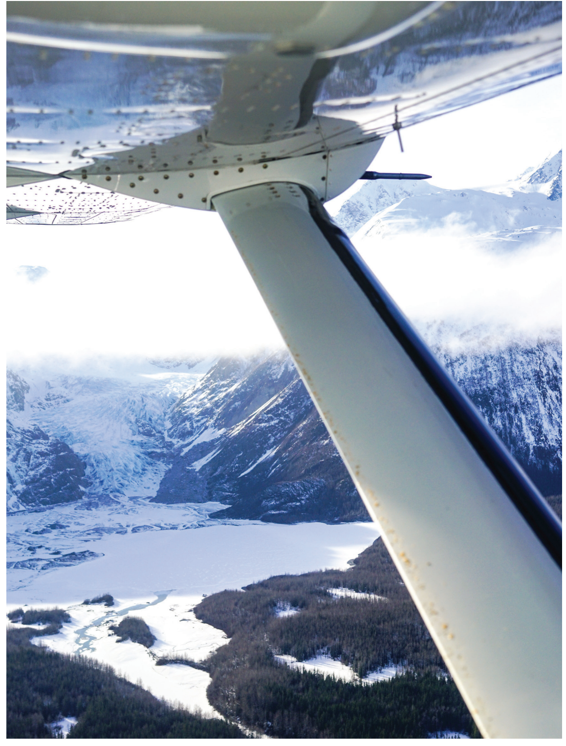
The view while flying from Sitka to the Farmers Summit in Haines.