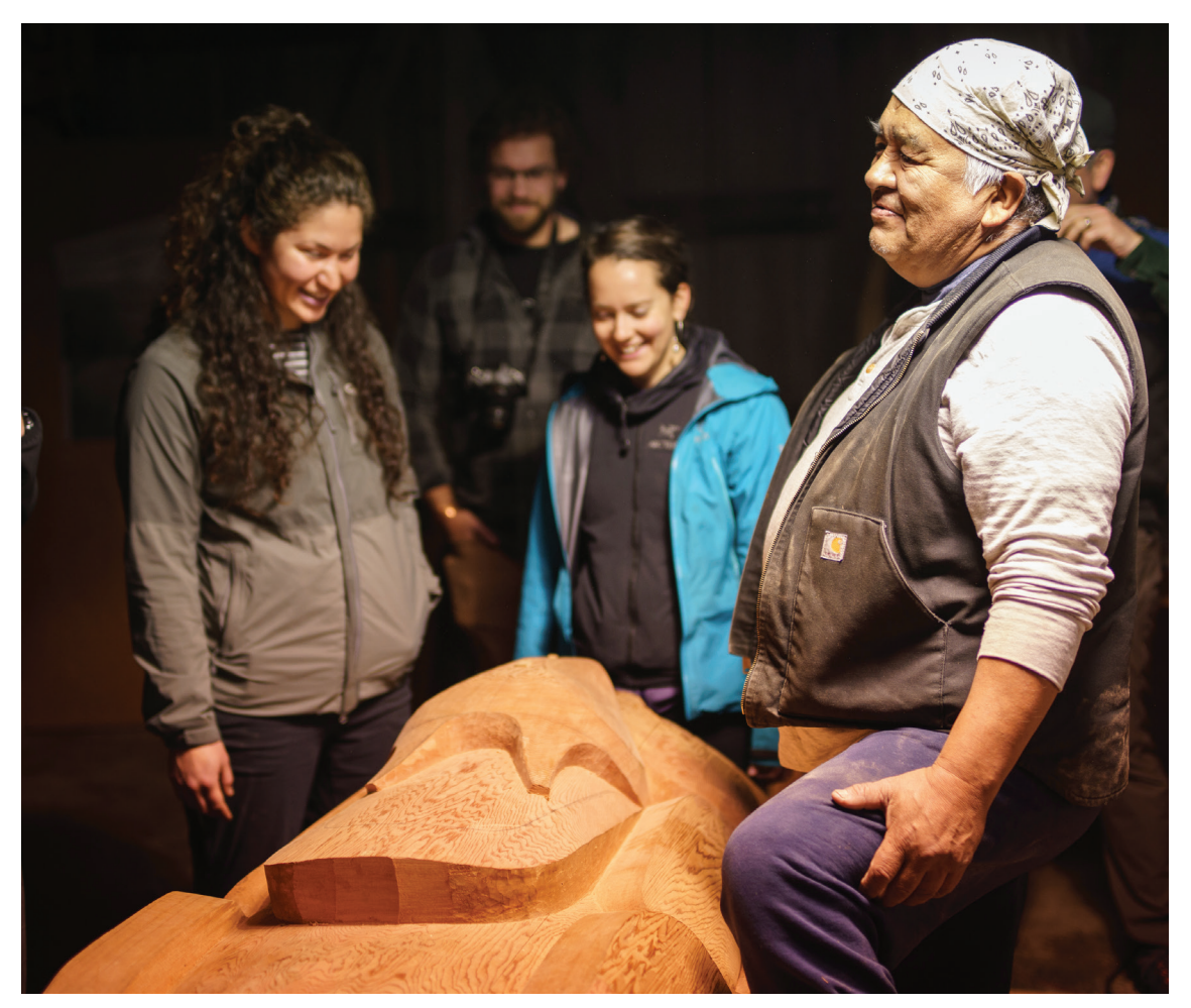
SSP participants gather around a wood carving in progress during the 5th annual 2018 retreat in the community of Hydaburg.

through collaborating with local schools to host the greenhouse and build curriculum around food gardening. One focus group participant in Hoonah, a student in one of the local schools, cited Moby as having taught him to grow chives, kale, sunflowers, and tomatoes, which he shared at family dinners. A focus group participant in Kake cited Moby as an example of increasing community empowerment through revitalizing local food, possibly leading to entrepreneurship: "I think rewiring people's mindsets to think about growing your own is something that we have been witnessing... Empowering people to think, 'I could do that. I could make money from that."