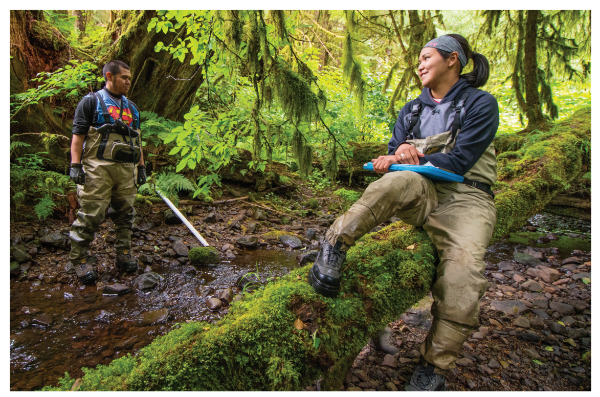
Members of the Hydaburg Stream Team assessing the conditions of salmon-bearing streams on Prince of Wales Island.

from SSP by the community-based host organization ($40,810). The host organizations use this funding to employ the Community Catalyst. For the regional level, this attribute was set at the level of the annual total general support received for the entire SSP network ($760,000). The SSP network uses this funding to support the Community and Regional Catalysts, host the bi-annual retreats, and support program administration and communications. For a more detailed description of the swing weighting methodology, see Chapter 4.