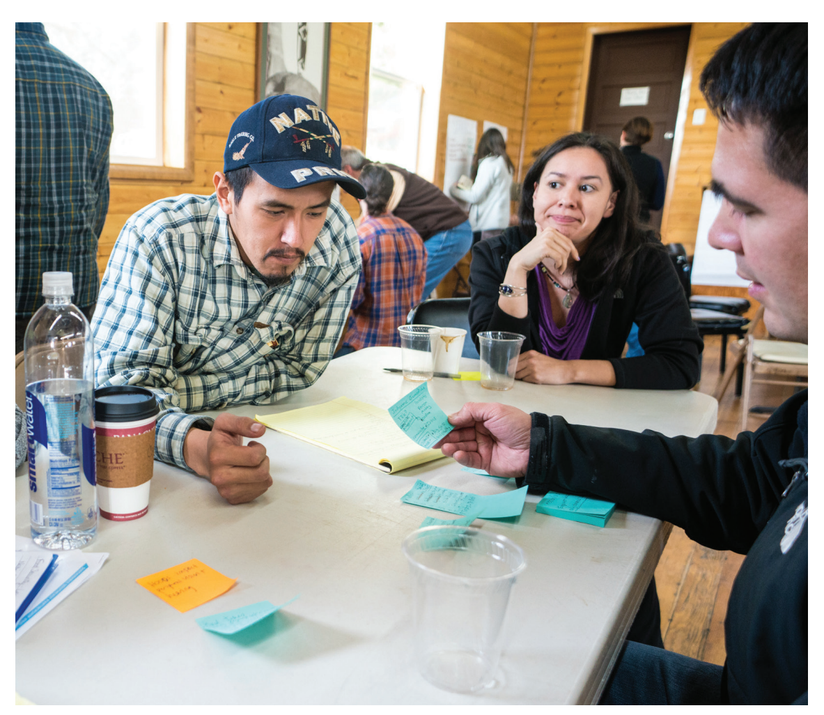
Participants gather for a breakout session during SSP's October 2017 retreat in Yakutat.