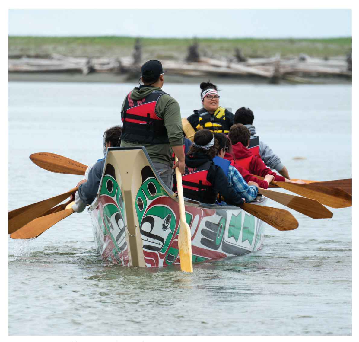
Participants in the 2017 Yakutat Culture Camp enjoy a canoe trip in the waters near Yakutat.

"SSP can show that working together isn't just limited to people and organizations. It's the whole ecosystem of Southeast Alaska: What are our resources? What are our strengths? What can we build upon?"